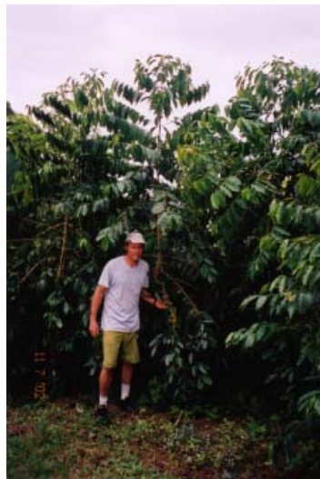
2 year old coffee trees already producing coffee beans!