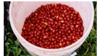
Grower Selected EM Grown Kona Coffee