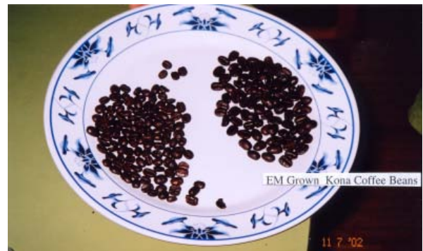
Lafayette Certified Organic Grown Kona Coffee Beans are much larger compared to other organically grown coffee. (Picture shows Lafayette Dark roast coffee beans to right of the picture vs. other organic Dark roast coffee beans.)

October 2003 – “Our farm speaks for itself. Only fertilized twice in 2.5 years and completely lush and pumping! Once people realize how much money they can save while actually improving their land, EM will catch on very rapidly.” Andrew Lafayette