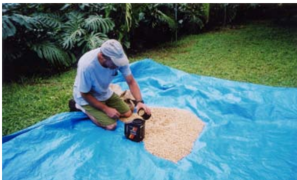
Sun dried to perfect moisture content for roasting.

October 2002 – “I’m sold on EM. Trees are awesome after one year of spraying. The entire farm transformed into extraordinary health. Also using EM with good results during fermentation & washing process.” Andrew Lafayette